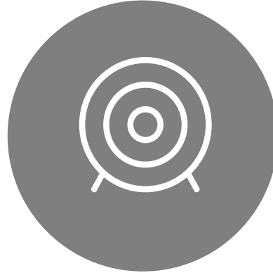
Examples of Channels We Can Advertise On