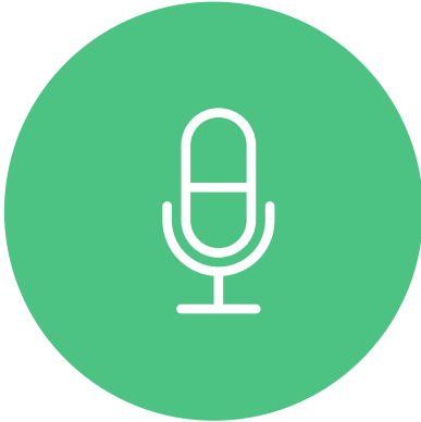
Examples of Channels We Can Own