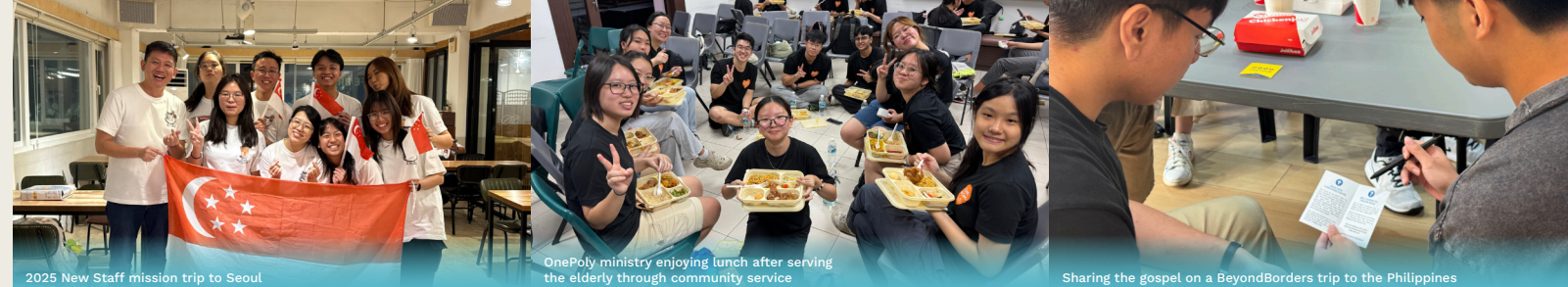
2025 New Staff mission trip to Seoul

In the past two years, we have seen 16 student interns and project staff join us for harvest-work equipping, and have launched two brand new internship programmes— CATALYST and FUEL .