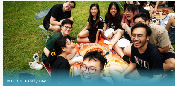
NTU Cru Family Day

16 creatives embarked on The Creative's Journey (TCJ) , a nine-month discipleship programme by Crea. They rediscovered their God-given purpose, explored new ways to express their creativity, and experienced a community that uplifts and points one another back to God.