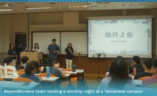
BeyondBorders team leading a worship night at a Taiwanese campus