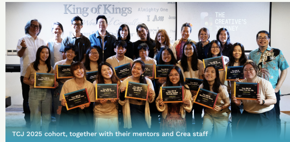
TCJ 2025 cohort, together with their mentors and Crea staff