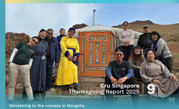
Cru Singapore Thanksgiving Report 2025