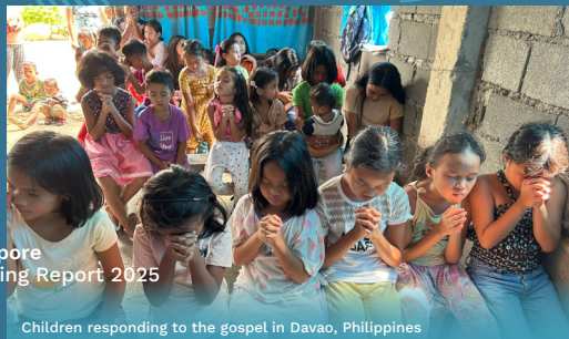
Children responding to the gospel in Davao, Philippines