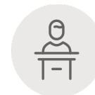
Conference and Events