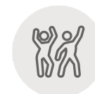
The Significance Project