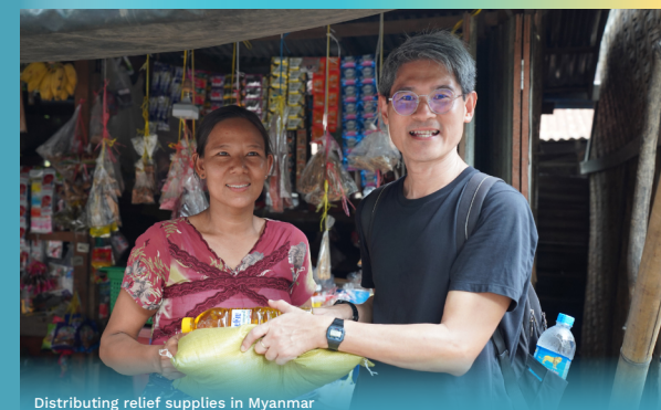
Distributing relief supplies in Myanmar