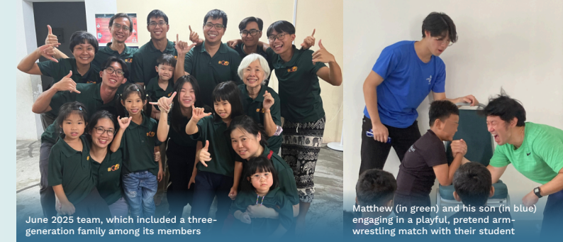
June 2025 team, which included a three-generation family among its members

Ultimately, missions is not just something that happens overseas—it begins right within the family, as they learn together what it means to love and serve God.