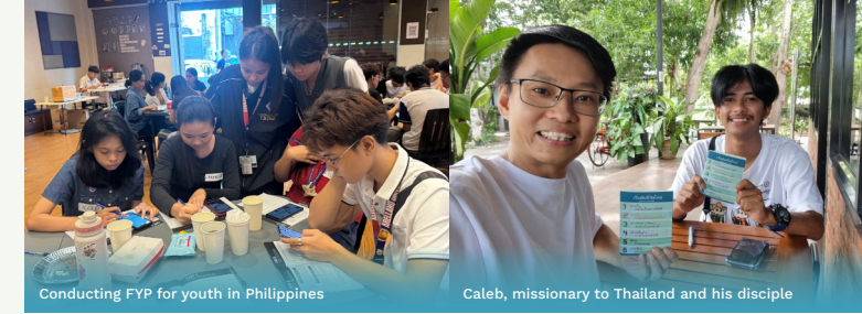
Conducting FYP for youth in Philippines