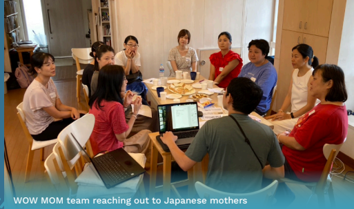
WOW MOM team reaching out to Japanese mothers