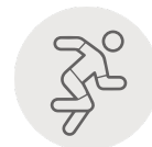
Athletes in Action