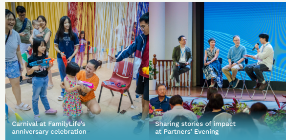
Carnival at FamilyLife's anniversary celebration