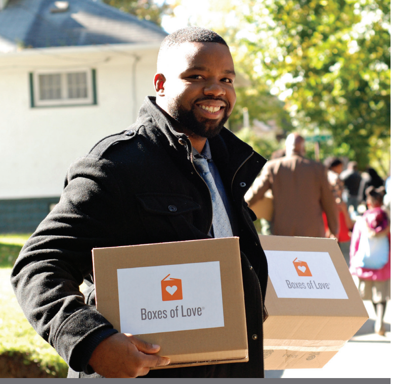
This Thanksgiving, so many impoverished innercity families were able to enjoy a warm meal — and experience the power of the love of Jesus — because friends like you reached out in compassion to send a Box of Love® to them.