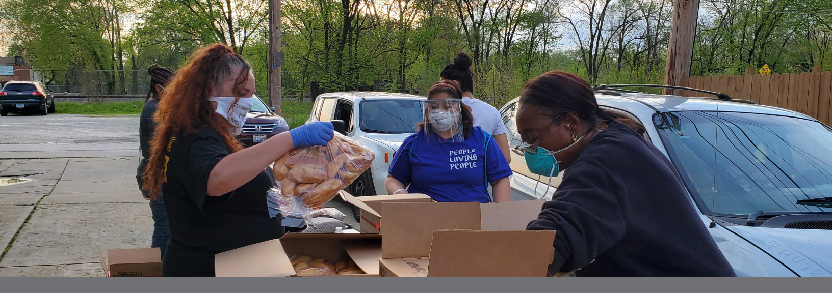
Throughout the pandemic, Cru<sup>®</sup> Inner City and our partner churches have adapted our outreach activities to effectively evangelize while meeting the physical needs of our community.